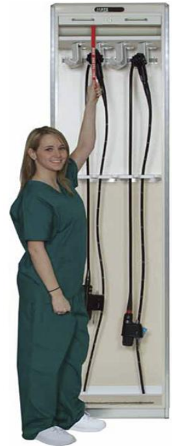
Cabinet for 9 Endoscopes