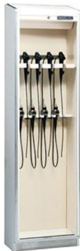
Cabinet especially designed for small-diameter scopes (bronchoscopes, cytosopes, ureteroscopes, TEE probes)