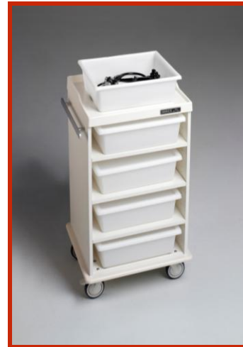
Scope Transport cart that is steam or machine washable