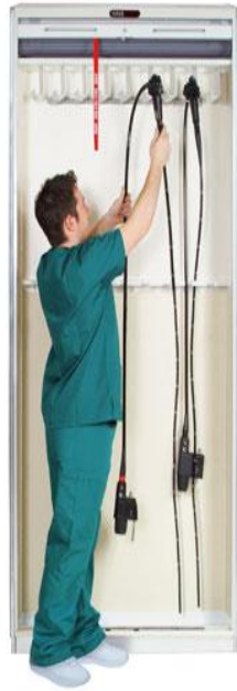
Cabinet for 8 flexible Endoscopes