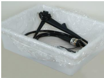
Autoclavable scope tray with liner